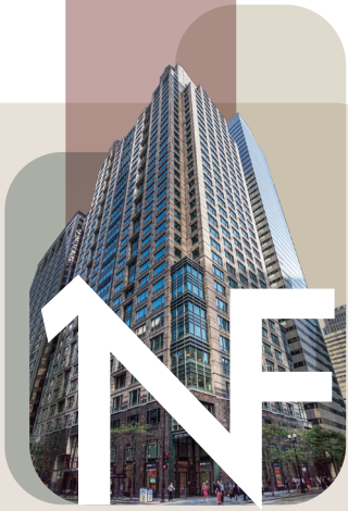
One North Franklin